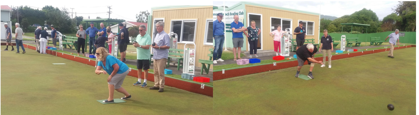
LAWN BOWLS ABOVE & CHRISTMAS CHEER BELOW