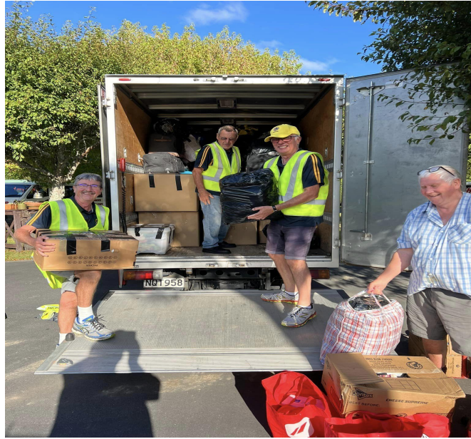
AND MORE RECENTLY HELP TO CYCLONE GABRIELLE WITH DONATED GOODS TO HAWKES BAY

Having Fun - Bowls, BBQS, Christmas Cheer and Bubbles & Brekkie!