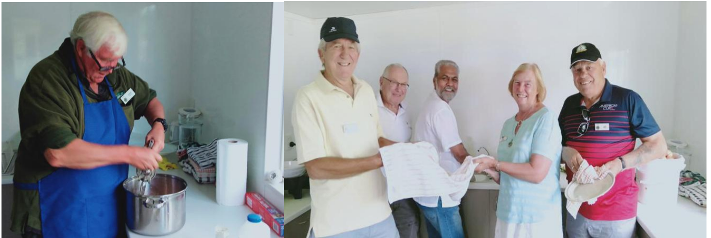
COOKS & CLEANUP @ CHAMPAGNE BREAKFAST

Having Fun - Bowls, BBQS, Christmas Cheer and Bubbles & Brekkie!