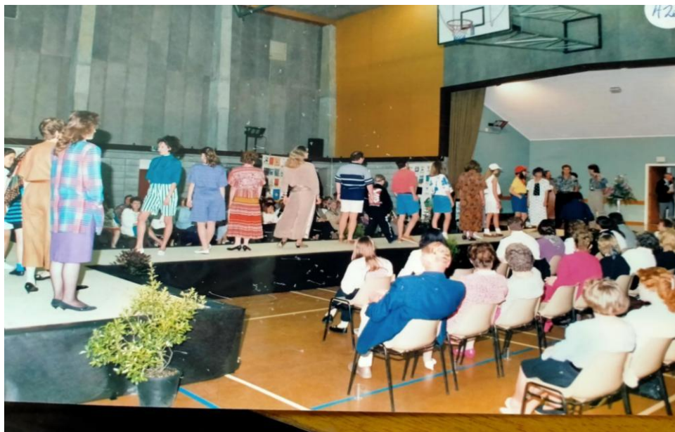
FASHION PARADE MEMORIAL HALL