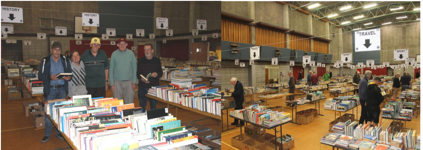
THE BOOK FAIRS