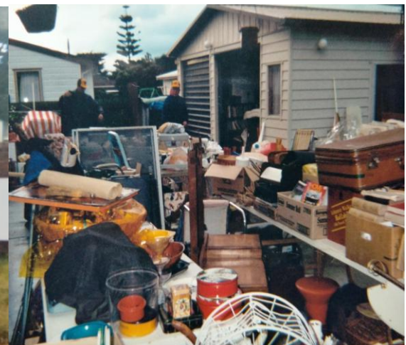
FIRST GARAGE SALES HELD AT A LION'S HOME