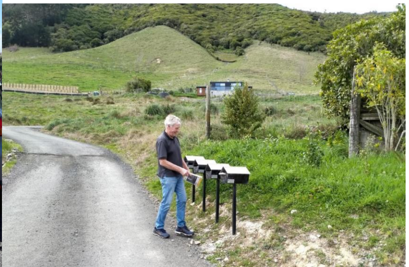
TELEPHONE BOOK DELIVERY