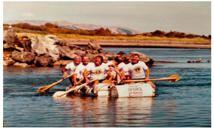
RAFT RACE WAIKANAE RIVER