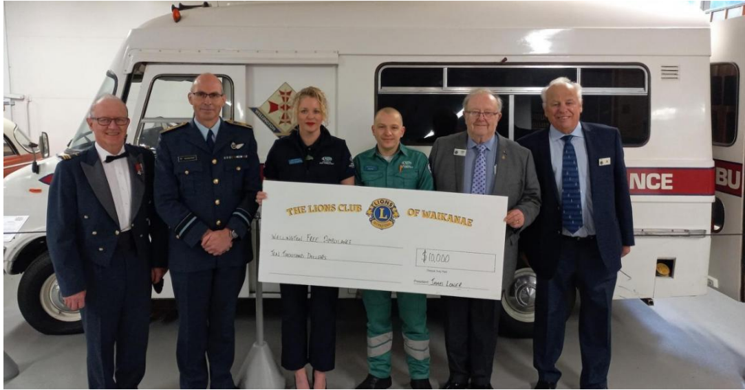
BAND CONCERT PROCEEDS TO WELLINGTON FREE AMBULANCE