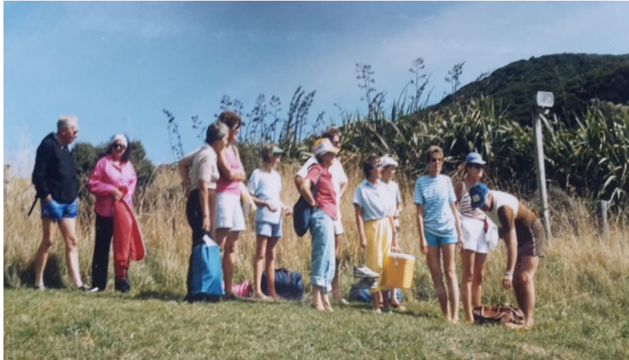
TRIP TO KAPITI ISLAND