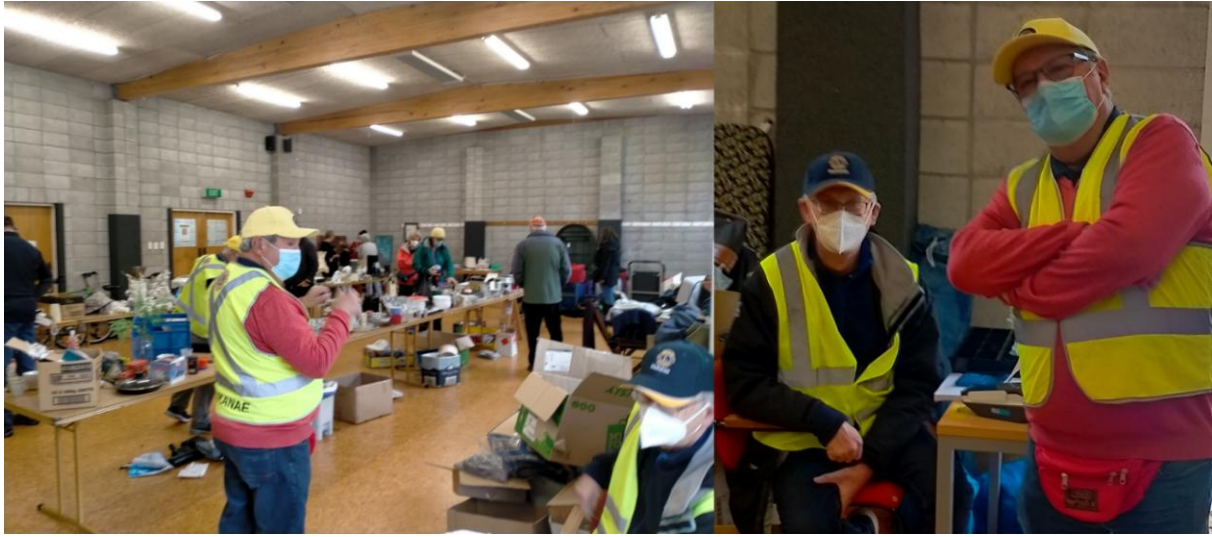
1 ST GARAGE SALE DURING PANDEMIC