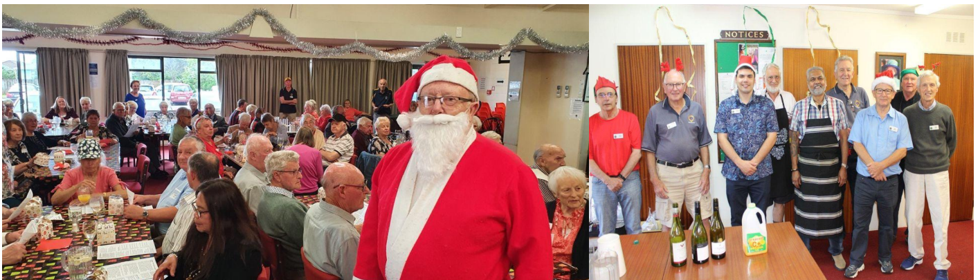
SENIOR CITIZEN'S CHRISTMAS LUNCH INCL SANTA AND HELPERS!