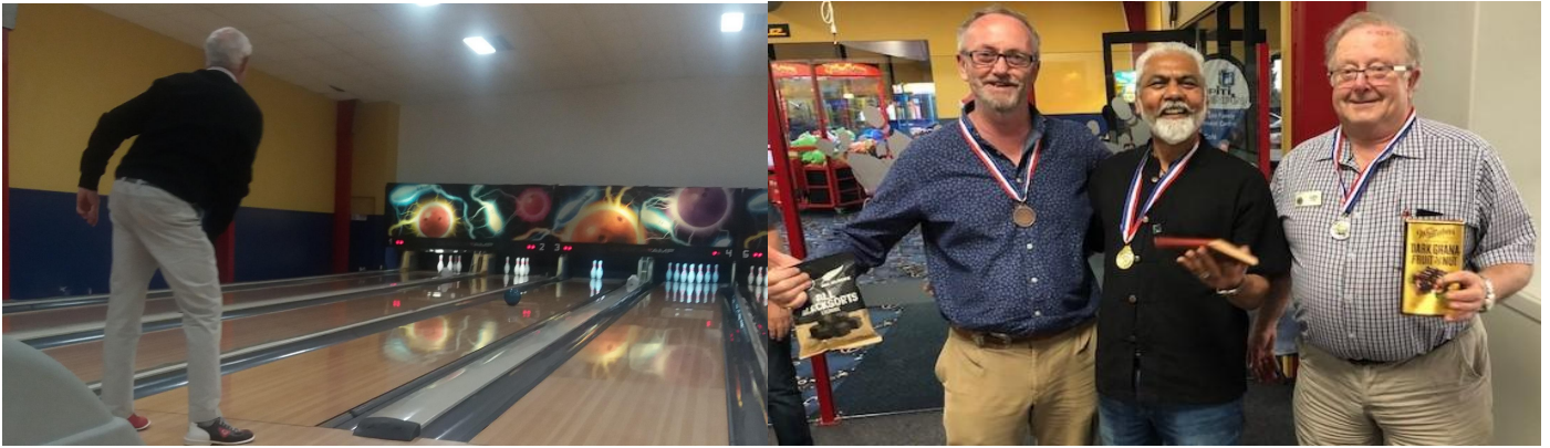
10 PIN BOWLING & CHAMPS