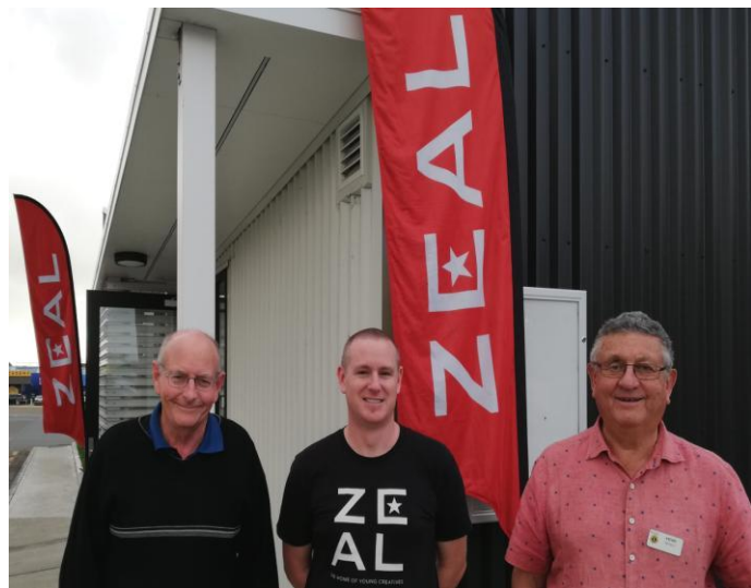
HELPING OUT KAPITI YOUTH - PARTNERSHIP WITH ZEAL