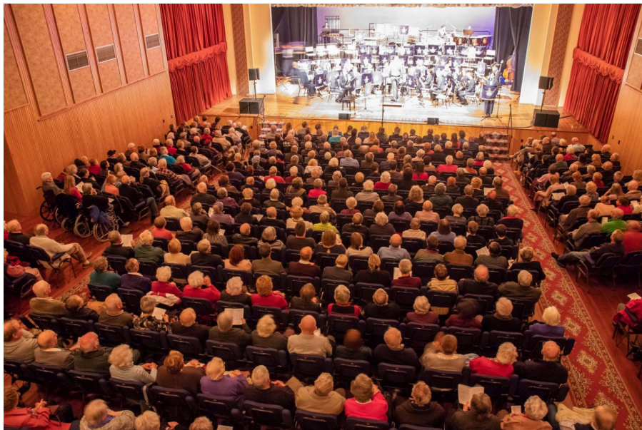
THE BAND CONCERTS @ SOUTHWARDS