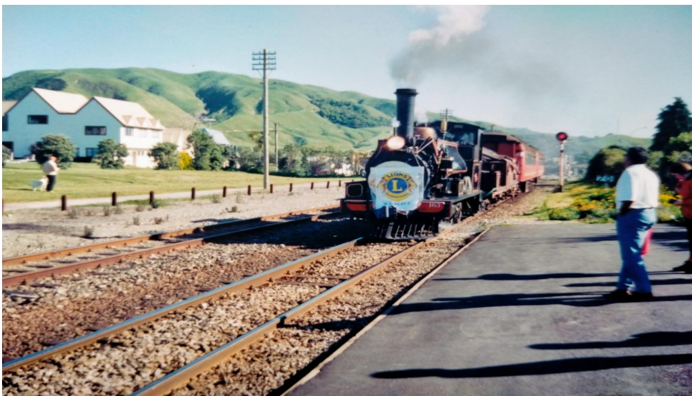
1994 LABOUR WEEKEND LION'S TRAIN RIDE: PALMERSTON NORTH, WAIKANAЕ, PARAPARAUMU, WAIKANAЕ, PALMERSTON NORTH