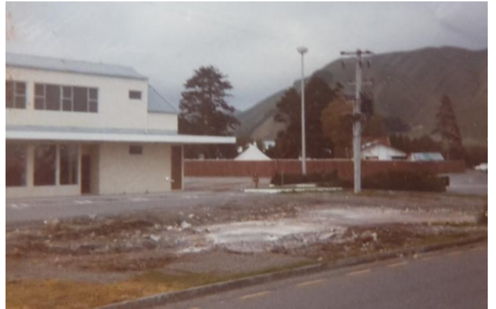
DEMOLITION OF OLD WAIKANAE MEDICAL CENTRE (Opposite Shoreline Cinema)