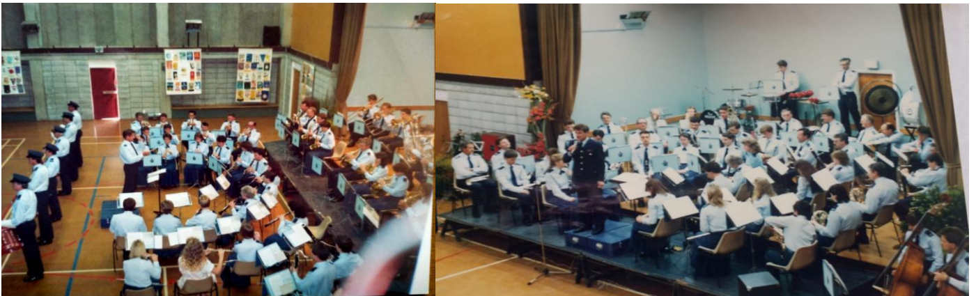
EARLY AIR FORCE BAND CONCERTS IN MEMORIAL HALL