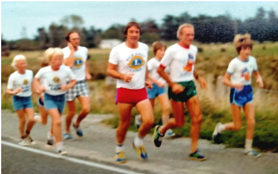
RUN FOR FUN