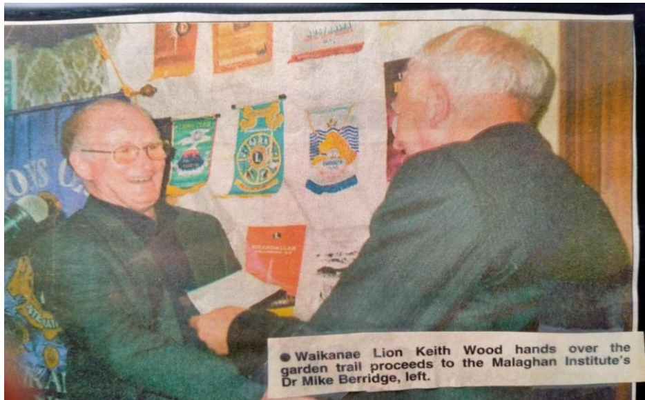
NEWSPAPER ITEM: GARDEN TRAIL PROCEEDS 2001 - $35,000 TO MALAGHAN INSTITUTE (A HUGE SUM OF MONEY THEN)